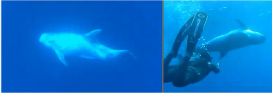
Figure 3. Risso's dolphin, Grampus griseus , swimming close to a diver in the north of Gökçeada (Photographer: Selim Konya, June 18, 2017).

In the summers of 2017, 2019 and 2020, a total of 28 Risso's dolphins were recorded while another 19 of them were recorded in the spring of 2018 and 2020 (Figure 3).