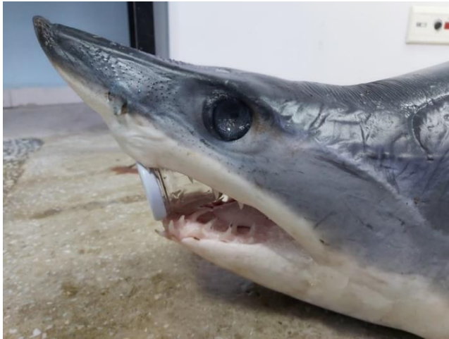
Figure 2. An individual of shortfin mako, Isurus oxyrinchus , reported by a fisherman on 4 April 2020

Two individuals of the species were recorded via social media platform. The first one was filmed in the west of the island on 23 May 2017. It is estimated to be greater than 2.5 m from the video. The picture of the other individual was shared on 4 April 2020 (Figure 2). The size of the photographed individual was estimated about 2 m. According to the morphological characteristics of the individuals in visual materials, the specimens were identified as shortfin mako shark.